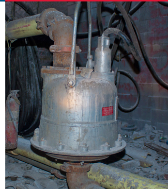
In-line staged submersible pump increases pumping distance.