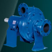
6500 Series® Standard Horizontal End Suction