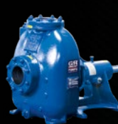
80 Series® Self-Priming