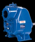
Ultra V Series® Self-Priming