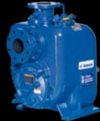
Super U Series® Self-Priming