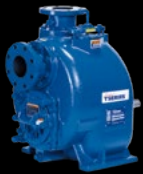
Super T Series® Self-Priming