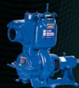
10 Series® Self-Priming